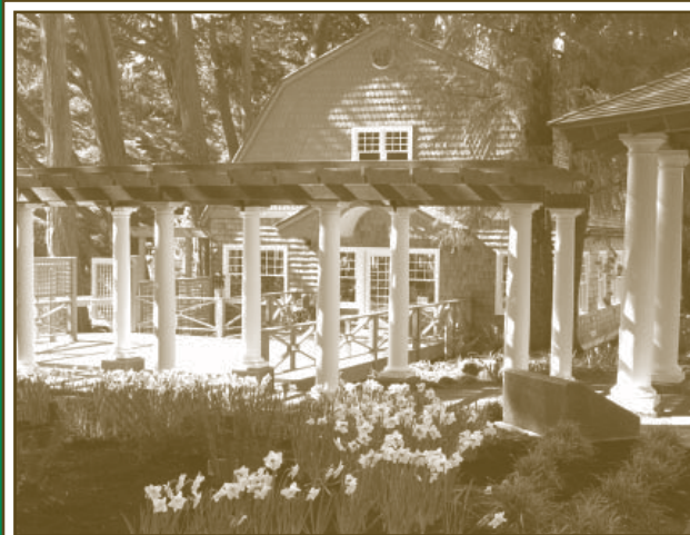
Garden Entrance and Information & Gift Center

Ongoing interpretive projects include brochures, newsletter, new plants, and signs.