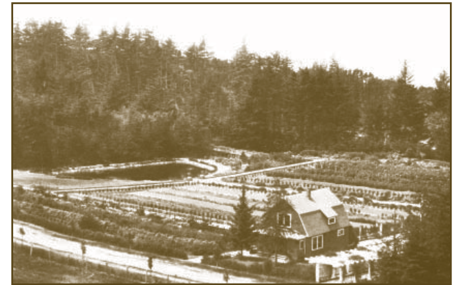
Garden House (former Gardener's Cottage ) - early 1900s - Note the half-moon shape of the "first" pond which Simpson would modify to present shape, circa 1914

1942, December - The Simpsons sold the remainder of the estate for $29,000 to Oregon for the development of a public park.